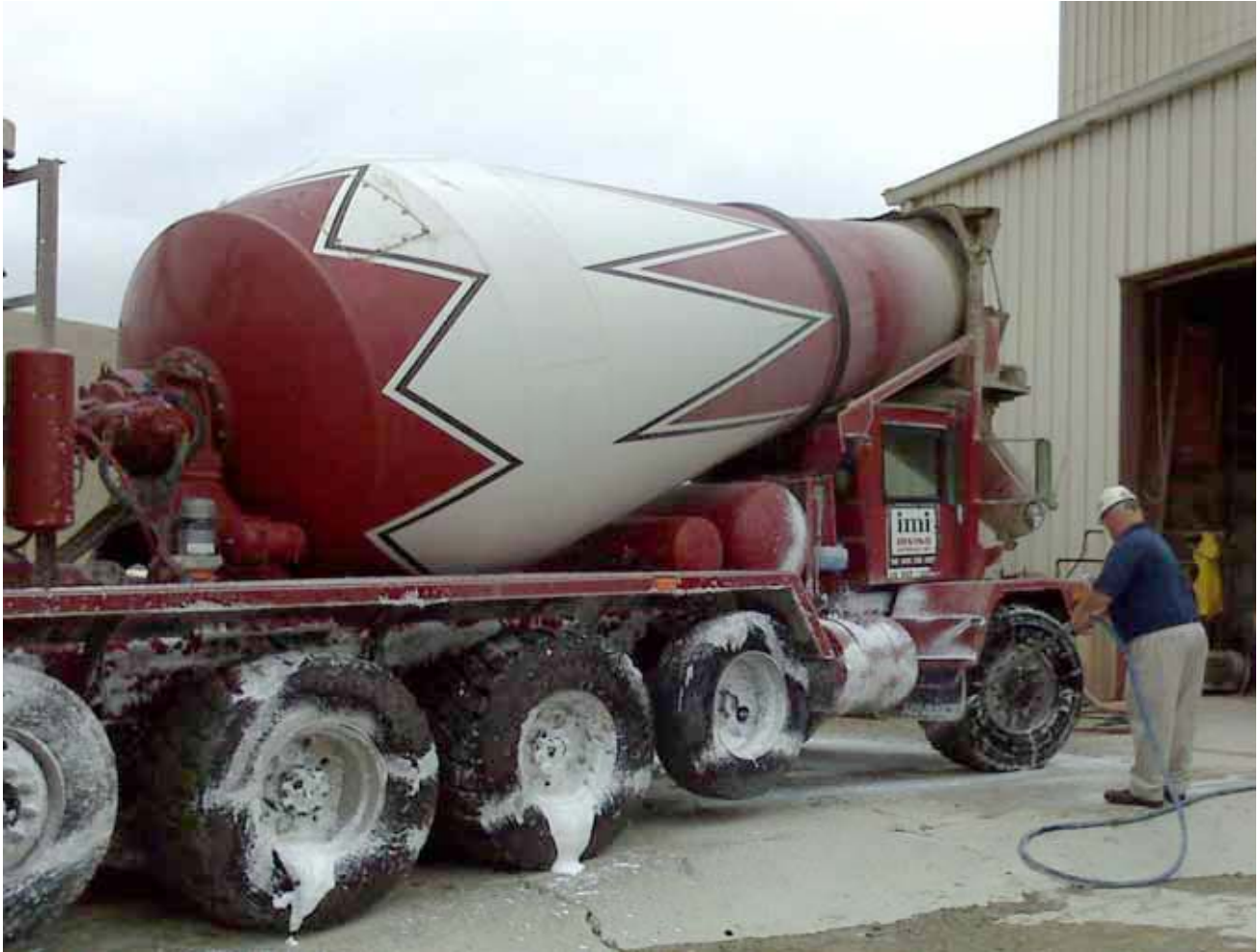
Lynx “Jackhammer” Being Foamed Onto IMI Concrete Truck to Remove Heavy Concrete