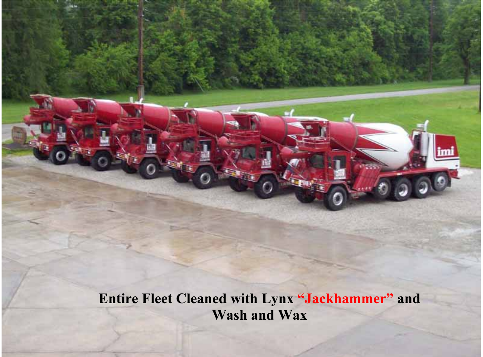
Entire Fleet Cleaned with Lynx “Jackhammer” and Wash and Wax