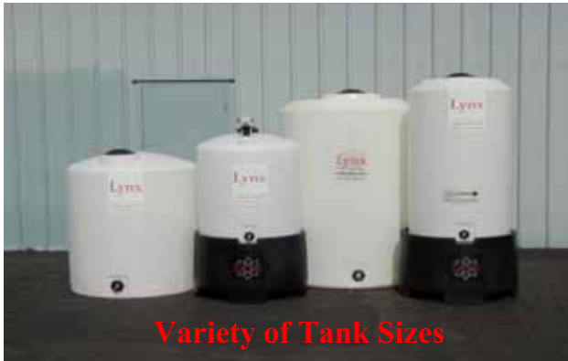
Variety of Tank Sizes