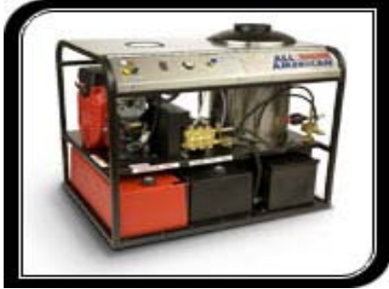
All American Premier Series Electric Start Gasoline Engine Oil Fired Burner 5 GPM @ 3,000 PSI

Lynx Has Equipment For All Tough Applications Power Washer Sales / Service / Parts / Rental / Lease Hot / Cold / Steam Units & Foamers for All Applications Custom Detergent & Cleaning Installations