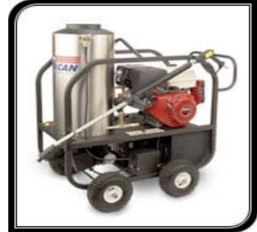
All American Dominator Series Gas or Electric Powered Motor Oil Fired Burner 4 GPM @ 3,000 PSI