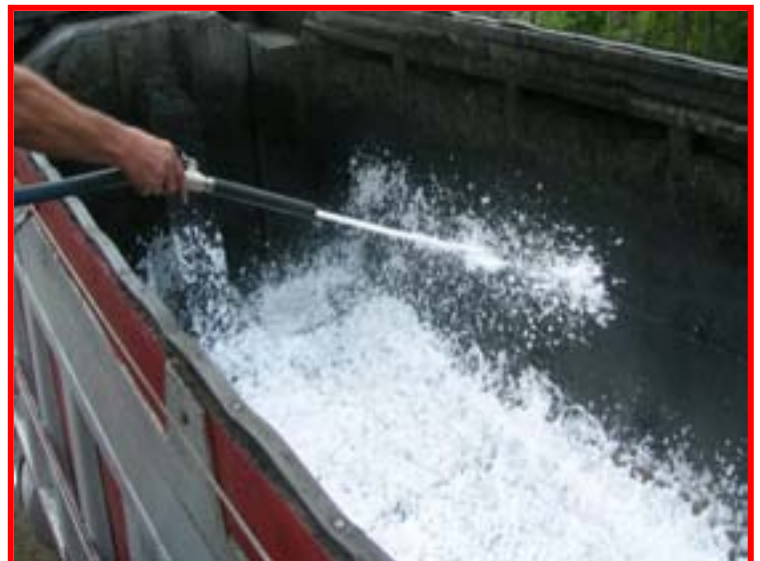
Easy Discharge Wand with 20' Foam Projection