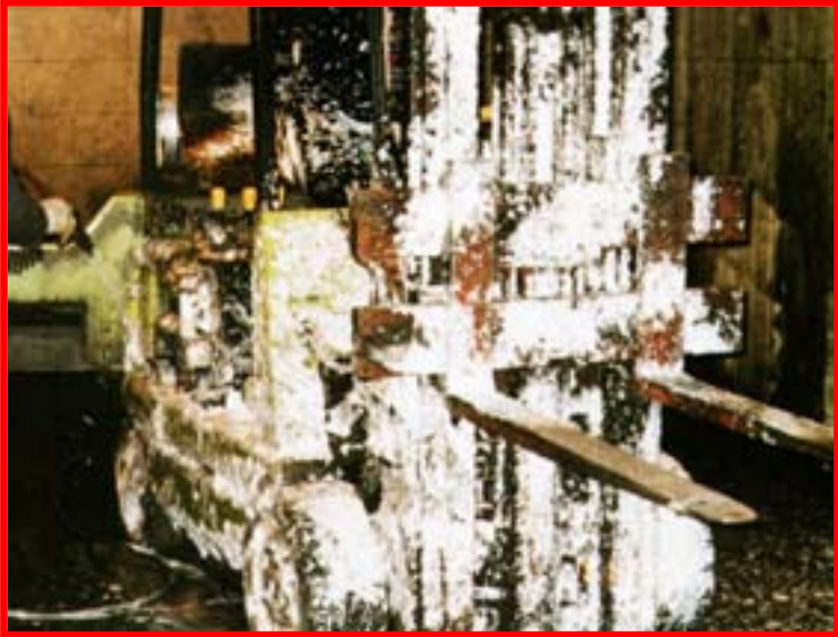
Tow Motor Foamed Prior to Rinsing