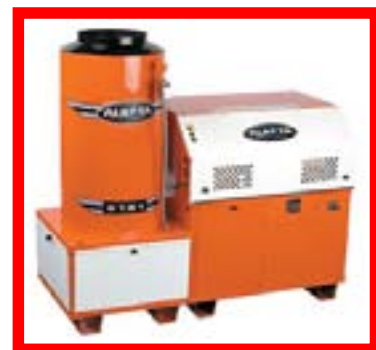
All American Gas Series 230 Volt, 3 Phase or 220 Volt, Single Phase 4 GPM @ 3,000 PSI