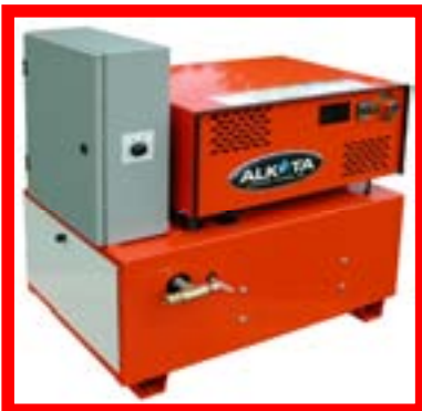
Alkota Stationary Unit All Electric Motor 240 Volt or 480 Volt, 3 Phase 3.5 GPM @ 3,000 PSI

Mount your Power Washer, Tank and Hose Reels to One Easy to Use Portable Trailer