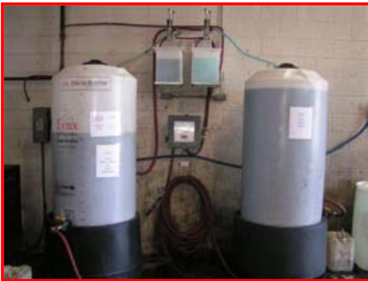
DrumBuster™ Tank / Wall Mounted Foamer / Automatic Mixing Equipment / Custom Installation